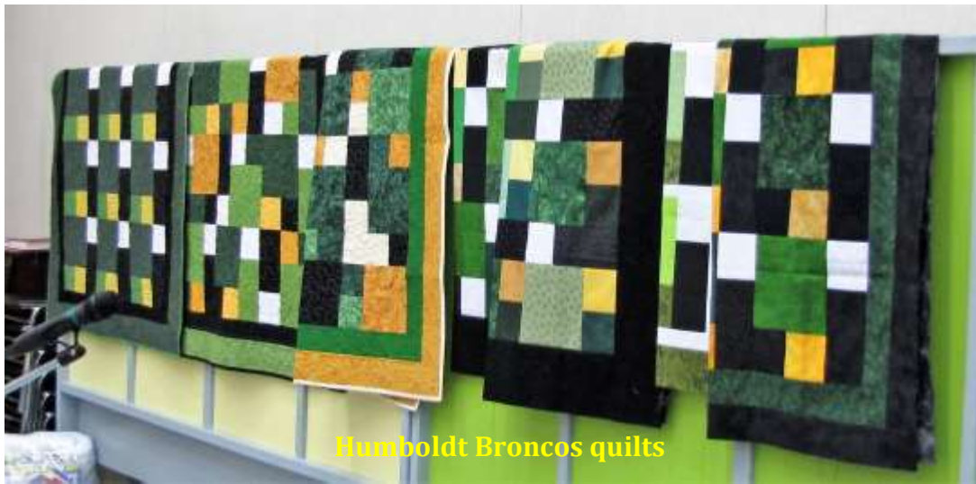
Humboldt Broncos quilts