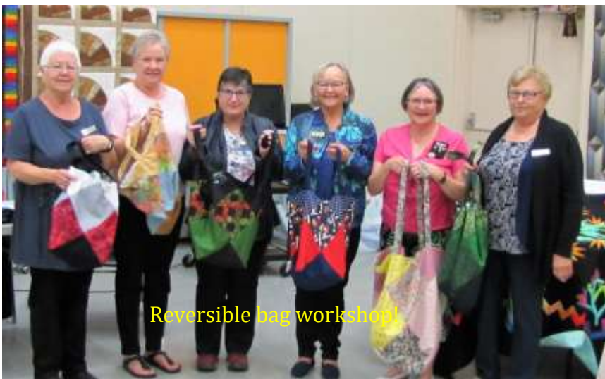
Reversible bag workshop