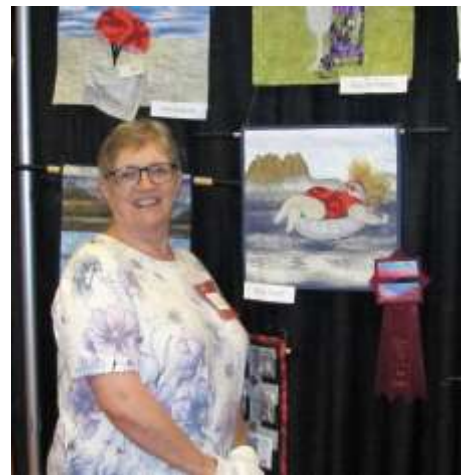
Challenge Quilt 1 st place winner