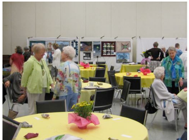
More of our 30 th Anniversary and all those lovely cupcakes!

Please help us help kids! Janome Canada H.A. Kidd and Company Limited Brother SewsWonderFil Gammill Quilting Kawartha Quilting Systems